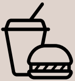
Food & Beverages

Halal Trade, Logistics and Manufacturing Expo will further strengthen Africa's position as a global halal hub and put forward the economic values of Halal for the world.