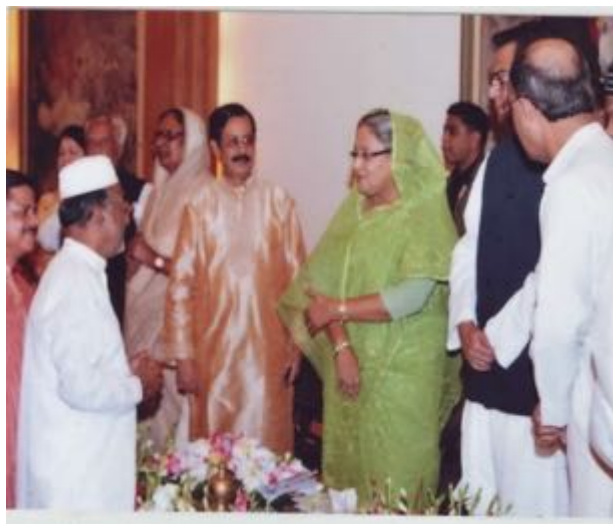
Pic: Exchanging pleasantries with the Hon. Prime Minister of Bangladesh, Sheikh Hasina