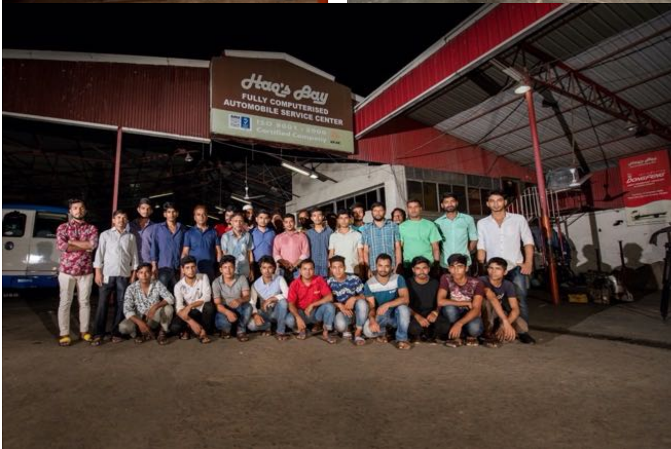
Top Left: Service centre personnel inspecting vehicle on hydraulic lift Top right: Large Service area that can be utilised for repair works as well as CKD purposes Bottom: The service centre team