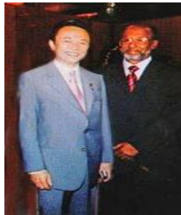
Pic: With former Hon. Prime Minister of Japan, Mr. Shinzō Abe (Left) and his successor, Hon Prime Minister of Japan, Mr. Tarō Asō, during their respective visits in Bangladesh as a leading dignitary representing Japan Bangladesh Chamber of Commerce and Industry (JBCCI).