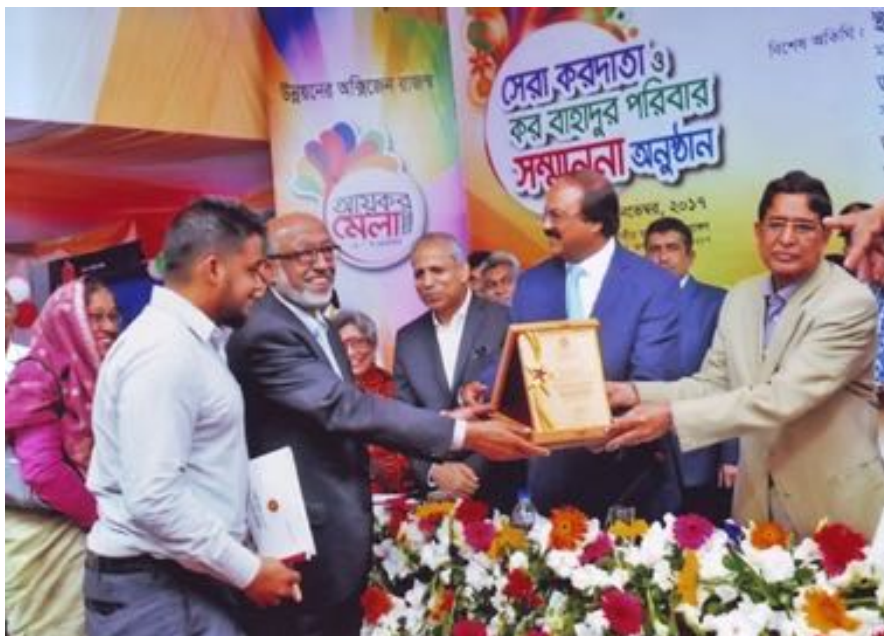
Pic: Receiving recognition from the Govt. of Bangladesh for “কর বাহাদুর পরিবার”