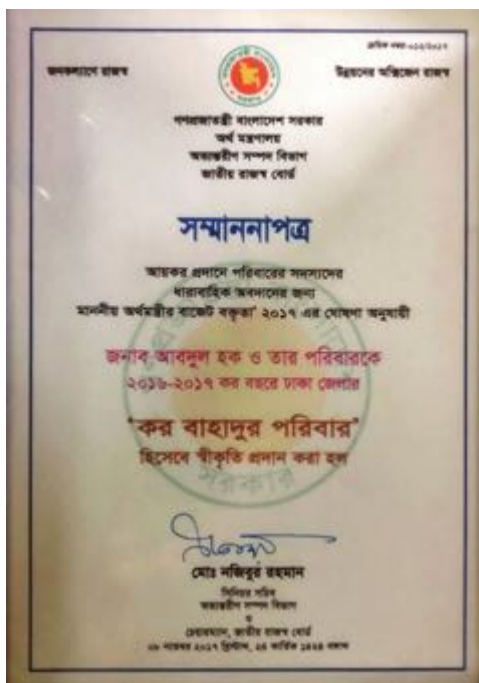
Pic: “কর বাহাদুর পরিবার” recognition from the Govt. of Bangladesh