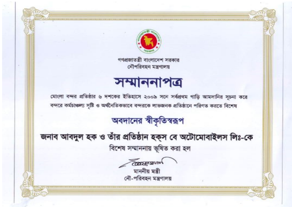
Pic: Recognition letter from the Hon. Shipping Minister of Bangladesh for exemplary role played in Reopening of Mongla Port