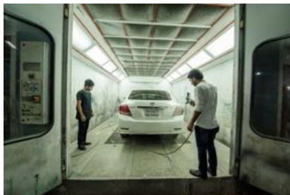
Paint work ongoing in fully equipped paint booth

No single automotive trader in Bangladesh has such comprehensive workshop and support engineering facilities at one place, which will cater all the technical needs of the customers. This facility is now being considered to be expanded and optimally used for other commercial/Industrial operations, like reconditioning of automotive vehicles, using the bonded house concept. Haq's Bay is also